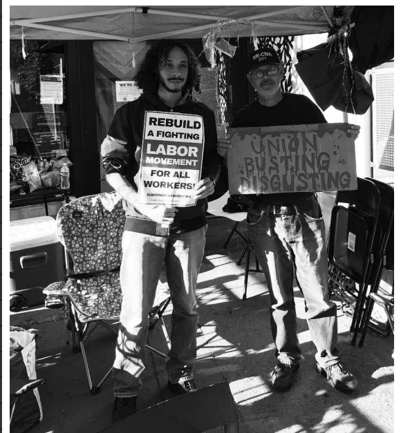
Local 201 and North Shore Labor Council members on the picket line for Starbucks